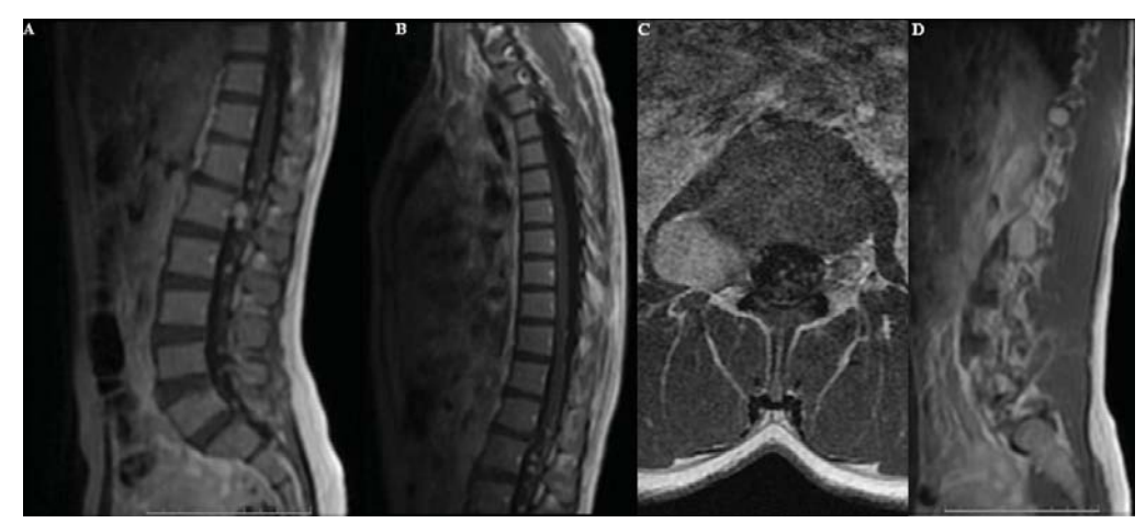
Figure 3. In the spine MRI scan, intradular intra-extramedullary masses; A, B) retaining contrast medium in the thoraco-lumbar spinal canal, and neurofibromas; C, D) composed of neural foramens and extending into the parasagittal soft tissue are observed.