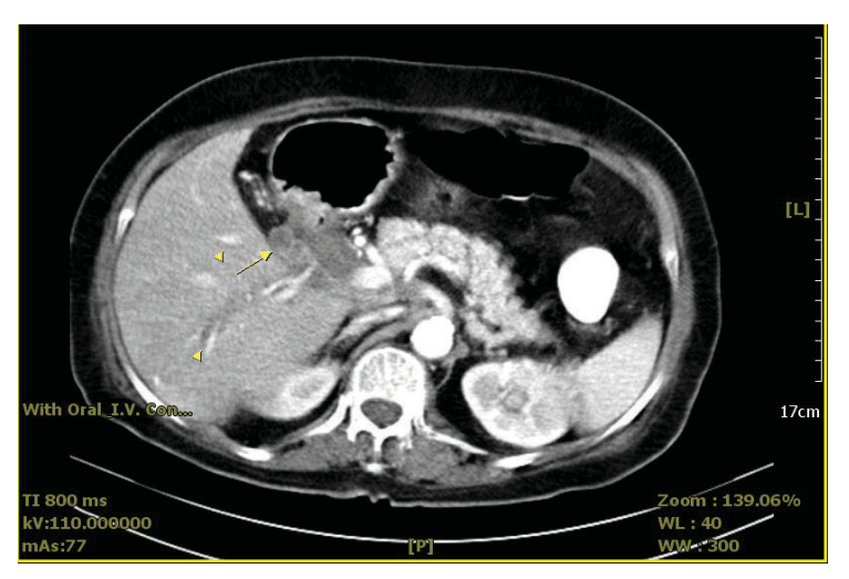
Figure 1. Abdominal CT scan with oral and intravenous contrast demonstrate dilated intrahepatic biliary system (arrow head) and the common bile duct (arrow).