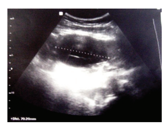
Figure 1. Sonography of the hepatic mass

A 32-year-old woman presented with flank pain. She was found to have a hepatic cyst by sonography in the medial segment of the left hepatic lobe, which measured 70 mm in diameter (Figure 1) and was confirmed by CT scan (Figure 2).