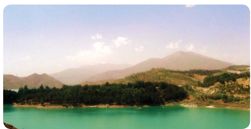
A view of Latyan dam which is located around 25 km from Tehran.