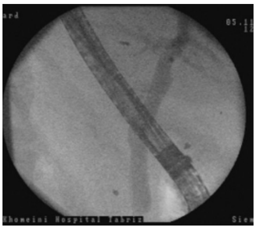
Figure 3. Endoscopic retrograde cholangiopancreatiocography imaging window after extraction of the foreign body following sphincterotomy

of obstructive jaundice.<sup>11</sup> Ban et al., in a review of 63 patients with foreign bodies in their biliary tracts during the past 75 years, report the most frequently encountered foreign bodies to be residuals from previous operations such as suture materials and endoclips (30 patients) and foreign bodies due to penetrating injuries which have been found in 12 patients. They place foreign bodies into three main categories: operative residuals, ingested objects and missiles.<sup>12</sup>