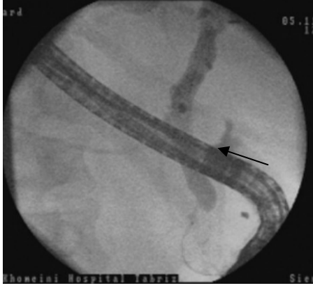
Figure 2. Endoscopic retrograde cholangiopancreatography imaging window showing a foreign body (black arrow) in the CBD before sphincterotomy

Foreign bodies in the biliary tree are rare causes