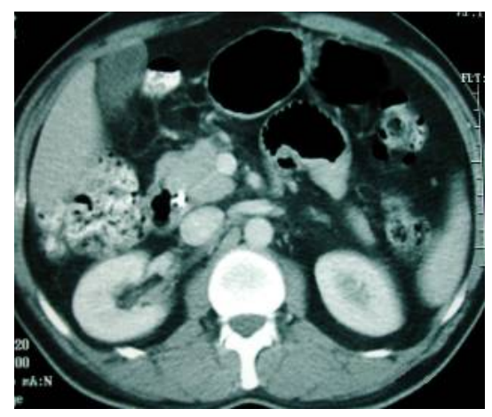
Figure 1. Spiral computed tomography (CT) scan showing a shrapnel splinter (right arrow) in the periampullary area near the head of the pancreas

of the liver, right kidney, subcutaneous tissue, and one in the periampullary area near the head of the pancreas (Figure 1). The latter one was presumed to be the probable cause of the patient's symptoms, thus the patient underwent a diagnostic endoscopic retrograde cholangiopancreatiocography (ERCP). There was a narrow segment dilatation in the common bile duct (CBD) and a filling defect in the CBD portion, which suggested a foreign body with a size of 5×7 mm (Figure 2). Subsequently, a sphincterotomy was performed and the foreign body, which was similar to shrapnel splinter, was pulled from the duct with a basket (Figures 3 and 4). The patient was assessed in the outpatient clinic two weeks later and found to be in good condition without evidence of jaundice or abdominal pain. Laboratory tests were within normal limits.