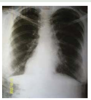
Figure 1. Chest X-ray showed not only the presence of bronchiectasis, particularly in the lower zones, but also dextrocardia.