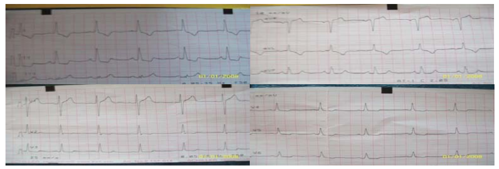
Figure 2. ECG of the patient remarkable for a T wave inversion in II, III, and aVL.