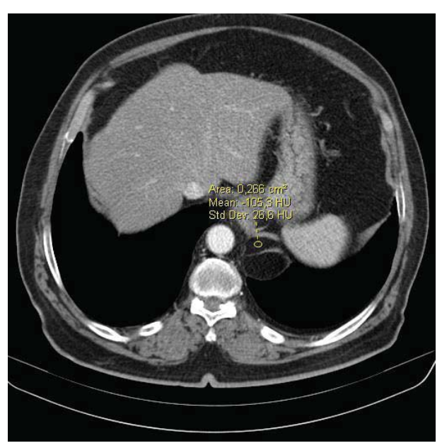
Figure 1. Left diaphragmatic crura showed a smooth, rounded small hypodense mass that measured approximately -105 HU, which was consistent with adipose tissue.