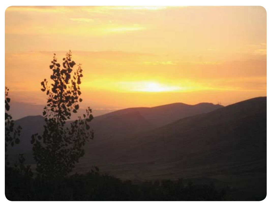
A sunrise view in Talegan - Alborz Province - Iran.