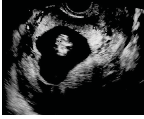
Figure 2. Ultrasonographic image taken at eight weeks' gestation shows the gestational sac has moved further towards the uterine cavity and seems to be invading the cavity space.