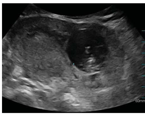
Figure 4. Ultrasonographic image taken at 12 weeks' gestation shows the gestational sac to be embedded within the anterior lower segment of the cesarean scar.

she became pregnant via embryo transfer freezing. Initially, a transvaginal ultrasonography was performed at six weeks' gestation which revealed a gestational sac beneath the uterine cavity, predicting the possibility of an EP within the cesarean section scar (Figure 1).