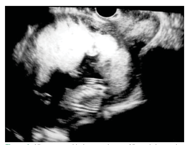
Figure 3. Ultrasonographic image taken at 25 weeks' gestation shows placenta previa and furthermore, the thinning of the myometrium between the placenta and bladder could be suggestive of placenta accreta.