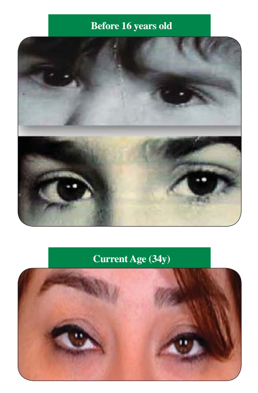
Figure 1. This figure shows ptosis observed in our proband's eye after age of 16 years.

any kind of skin blisters indicating epidermolysis bullosa simplex, nail deformity or alopecia were identified even subtle. There were no signs of respiratory complications, urinary problems or bulbar involvement. At age of 20 years, the serum creatine kinase (CK) and Lactate Dehydrogenase (LDH) levels showed significant elevation to the range up to 2000 and 700 U/L, respectively. In addition, acetylcholine receptor antibody was negative. Electro diagnostic examinations showed normal Nerve Conduction Velocity (N.C.V.) and Electromyography (E.M.G.) showed myopathic pattern 3 and 40 HZ repetitive nerve stimulation recorded from several muscles and orbicularis oculi. Single fiber electromyography (SFEMG) was negative. Echocardiogram showed normal heart function and the pulmonary function test was normal in both affected sisters.