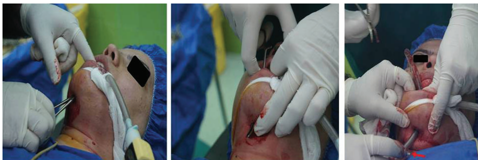
Figure 3. Performing the submandibular incision and blunt dissection close to the lower border of mandible, the second tube was grasped by Kelly forceps and pulled into the mouth from exterior to interior, while the first tube was in trachea property (Note that the cuff is not grasped).

This study consisted of eight male and three female patients, aged 22 to 42 years (mean, 30.8 \pm 6.47 year). Several types of craniomaxillofacial fracture which precluded both nasal and oral