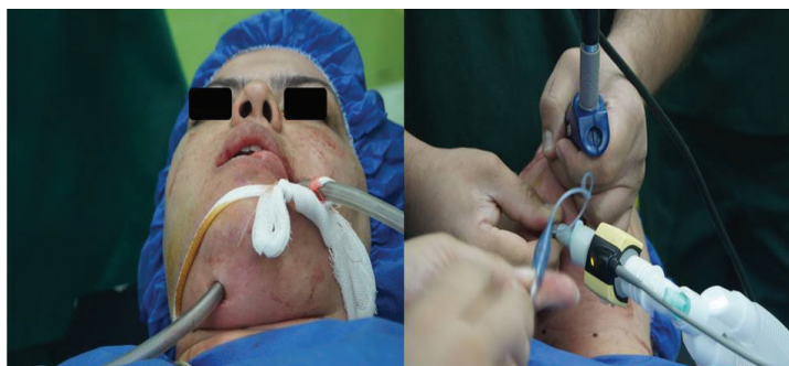
Figure 4. The second non-detachable connector tube substituted the first oral one conservatively with the aid of fiber-optic glidoscopy. (consider this new 2-tubes technique and also tubes position before the substitution).