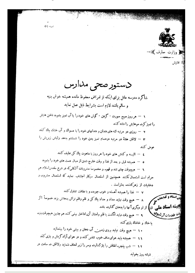
Figure 1. School Health Instructions, Issued by the Inspection Office Affiliated to Ministry of Sciences.

The National Archives of Iran holds several documents on the school modernization project, most of which pertain to girl schools in Tehran from 1927 to 1934. Given the patriarchal foundation of Iranian culture at the time, female students were in a critical condition. Even the permissibility of their education in modern schools was subject to question in this traditional society. Girls constantly faced severe health challenges due to pregnancy, sexually transmitted diseases (which sometimes were not even referred to experts), and their responsibility of taking care of children. In addition, the dress code (at least until the unveiling policy in 1935) exposed girls more than male students to greater risks of skin and hair diseases, which used to be quite common. Also, there were fewer female students and girl schools in Tehran compared to boy