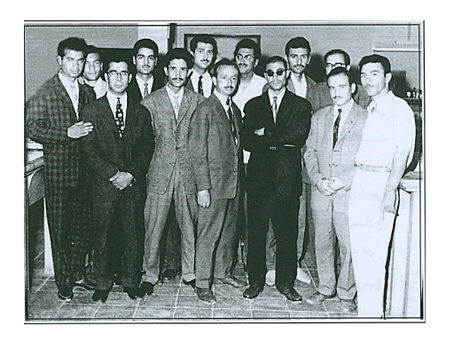
Figure 3. The first group of students who enrolled in the Isfahan University Pharmacy School in 1956.<sup>1</sup>

establishment of Isfahan University and its faculty of pharmacy (chapter 5), the history of students' admission at the higher scientific educational centers in Iran between 1956 and 1980 (chapter 6). The first group of students enrolled at the Isfahan Pharmacy School in 1956 (Figure 3).<sup>1</sup>