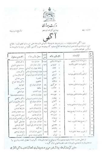
Figure 4. The List of Drugstores in Isfahan, 1950.<sup>1</sup>

Volume 3 narrates the history of the establishment of the traditional and modern drugstores in Isfahan and other cities of the Isfahan province during 20th century (chapter 7) (Figure 4). In volume 4, short biographies of the pharmacists who founded the private and governmental drugstores in Isfahan appear respectively in chapters 8, 9 and 10. In the appendix of this volume, the medicinal plants which flourished in Isfahan are presented. Finally, the last volume deals with the Isfahan School of Pharmacy after the Islamic Revolution of 1979, as well as its management system and its managers from 1979 onwards (chapter 11). The Isfahan's drugstores after 1979, Isfahan's city zones, the distribution system of pharmaceutical products and the Isfahan's pharmaceutical industry are described in chapters 12, 13, 14, and 15. Aforementioned chapters are compiled based on valid resources a bibliography is