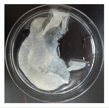
Figure 2. Removed Hydatid Cyst From Urinary Bladder of Patient.

Tri-chrome and Hematoxylin/eosin staining methods. Microscopic examination of prepared tissue sections showed Echinococcus granulosus protoscoleces with thick outer laminated hyaline layer (non-cellular membrane) with covers the thin activate germinal epithelium which represents the hydatid cyst diagnosis (Figure 3). In the follow-up, frequent urination problems were improved. For treatment, ciprofloxacin (500 mg) twice a day for three days, Albendazole (10 mg/kg/d) for a period of 12-weeks, and mebendazole (100 mg/kg/d) for 6 months were used. Sonography was recommended 1 month later. After surgery, the patient has recovered and discharged from hospital with a good general condition.